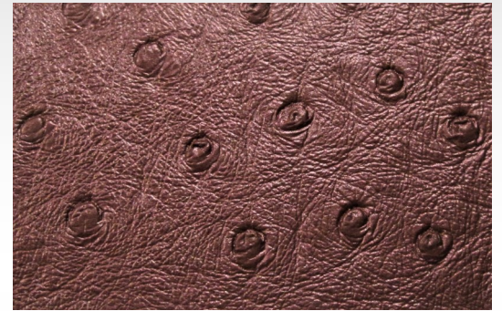
DC-H185B - 15