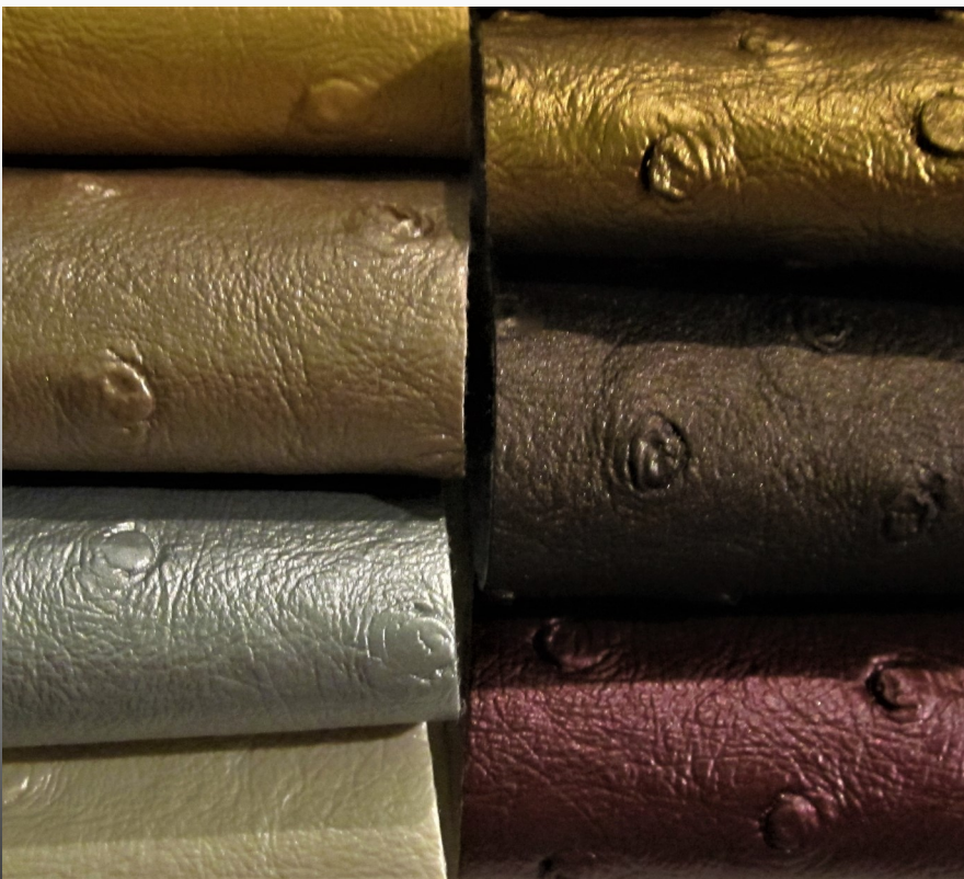
Ostrich DC-H185B - VARIOUS COLORS